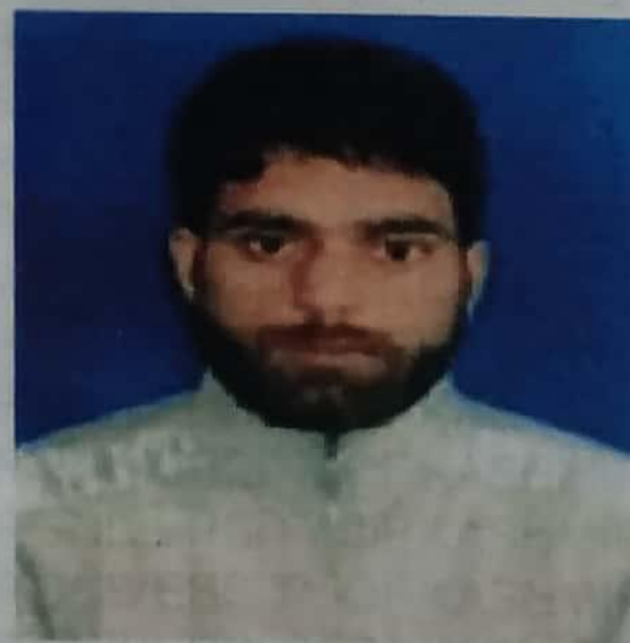
Chairman J & K SET Agency

Note: Incase category is shown in the SET Ref. No., the Recruitment Body should check the relevant documents of the candidate before appointment.